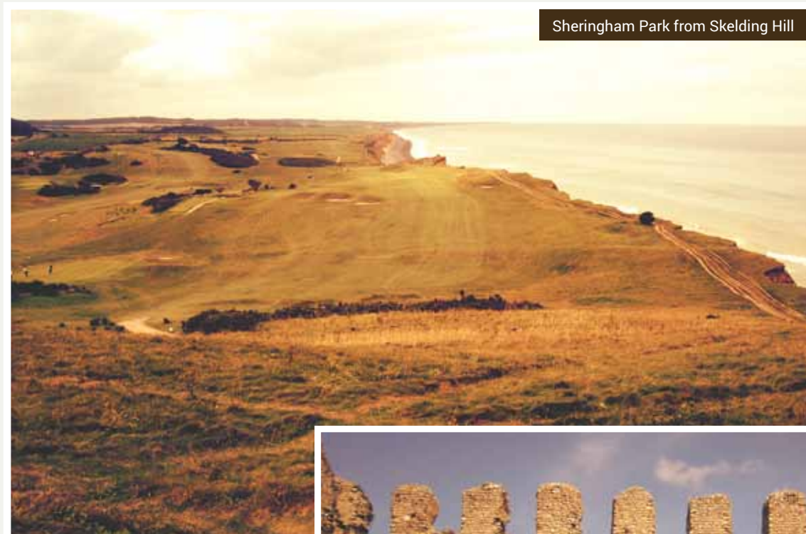
Sheringham Park from Skelding Hill