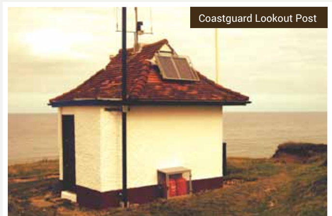
Coastguard Lookout Post

Keeping the sea on your left, enjoy the lovely views and the sea air as you stroll the 2.6 miles along the cliffs. You'll be on the Norfolk Coast Path so simply follow the National Trail marks (the acorn symbols) along to Sheringham. This is the perfect time for you and your owner to enjoy each other's company, so why not stay close and strike up a conversation? You never know, they might have finally learned to bark back.